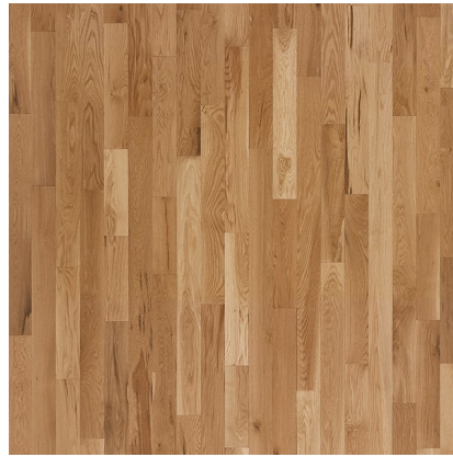
Porch Solid: HP41POCHB Engineered: EPTO4POCHE