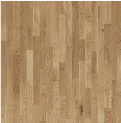
Bay Solid: HP41BAYB Engineered: EPTO4BAYB