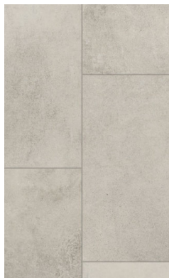
Calcium 139L 50053630