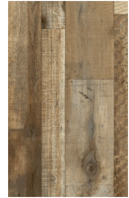
Pyrite 156M 50053634