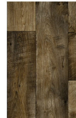
Tongsten 699D 50053632