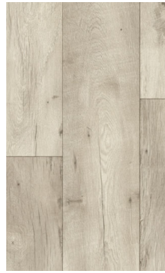
Sodium 369L 50053631