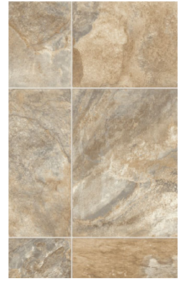
Lithium 170L 50053636