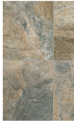
Zinc 369M 500536351