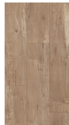
Thawed Maple 619L 62002444