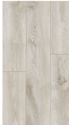
Snowy Oak 201L 62002446

Scan for more information on the Encompass collection.