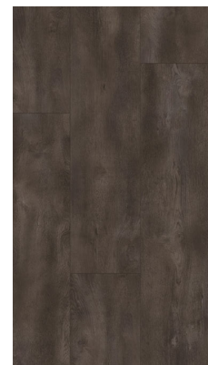
Charred Oak 996D 62002440