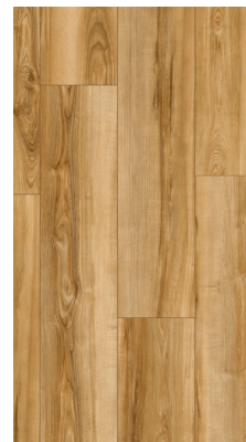
Autumn Ash 369M 62002442