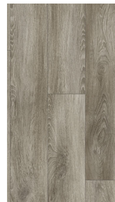
Plume Oak 909M 62002443