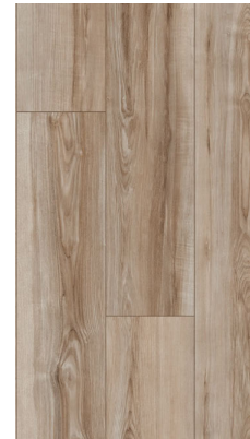
Winter Ash 901L 62002445