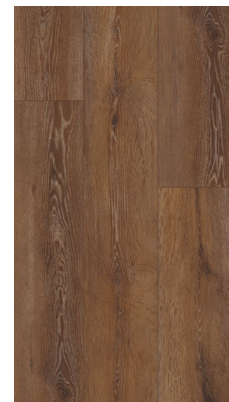
Sunset Oak 646D 62002441