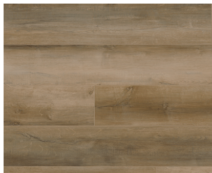
PERGOLA OAK | WE103