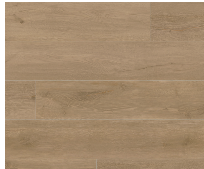
ORCHARD OAK | FA205