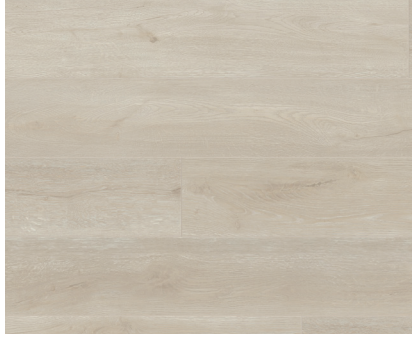
RURAL OAK | FA201