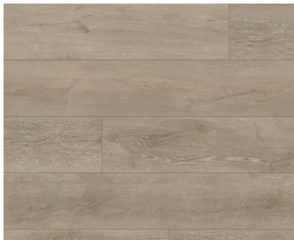
FIELD OAK | FA203