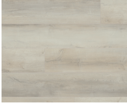
CLOUDLESS OAK | WE101