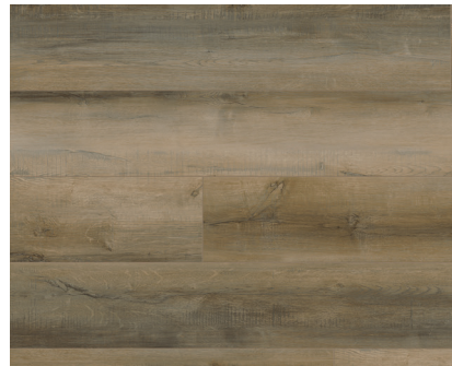
SWING OAK | WE105