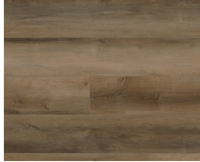
PATIO OAK | WE104