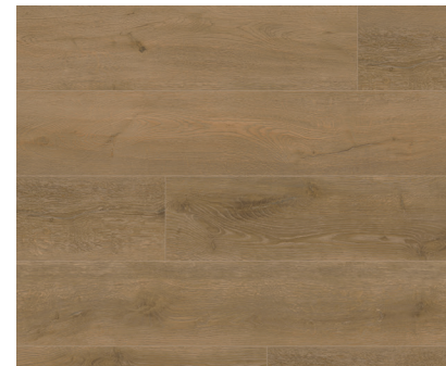
GARDEN OAK | FA206