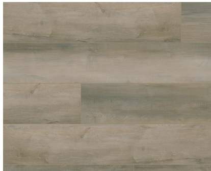
LAKESIDE OAK | WE102