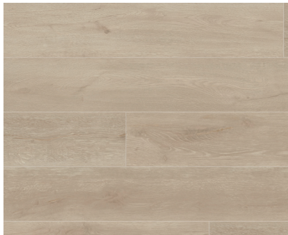
MEADOW OAK | FA202