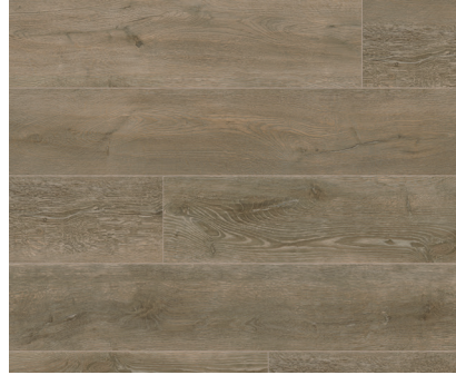
FOREST OAK | FA204