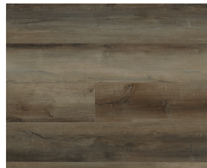
TREEHOUSE OAK | WE106