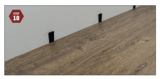
FINALIZE FLOOR Finished? Remove spacers and cover gaps with a trim.