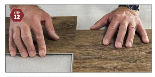
DISASSEMBLING THE SHORT SIDE Disassemble the row by sliding apart the planks on the short side.