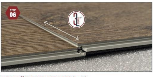
ENGAGE 3<sup>RD</sup> PLANK ON SHORT SIDE (Part I) Using the 3L TripleLock one piece drop-lock system, drop the short side of plank 3 onto the short side of plank 1.

ENGAGE 3<sup>80</sup> PLANK ON LONG SIDE Take another long plank (3). Repeating the previous step, insert the long side of plank 3 into the long side of plank 2. Then slide plank 3 to your left until the short side is in contact with the short side of plank 1.