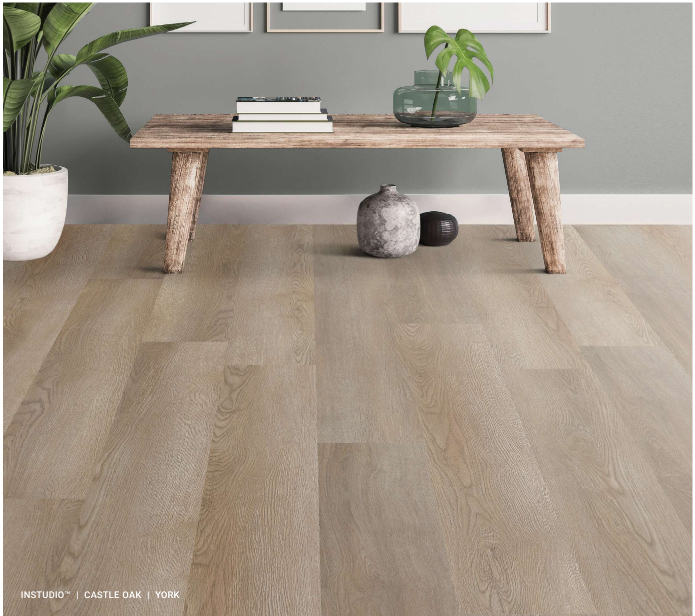
INSTUDIO™ | CASTLE OAK | YORK