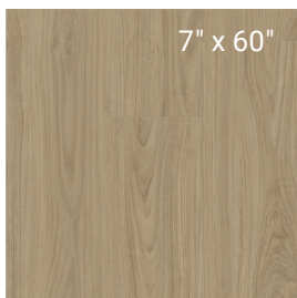
Lacebark Elm Wheat 270293004