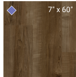
Barrel Aged Maple 270293016