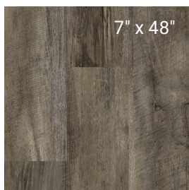
Sparrow Oak Gray Pearl 270285002