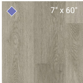
Cape Cod Bennett Grey 270293015