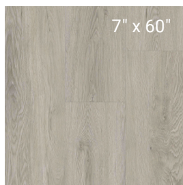
Pin Oak Drift 270293007