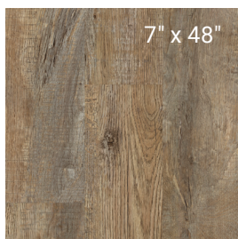
Chestnut Ridge Furrowed 270285005