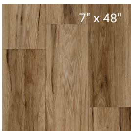
Pecan Flame Claro 270285006