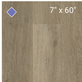
Cape Cod Hartford 270293013