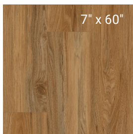
Black Walnut Spiced 270293006