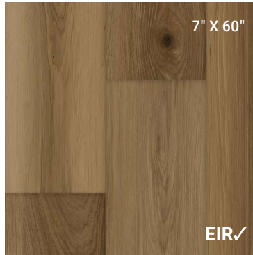
Tailored Hickory Tawny PP022