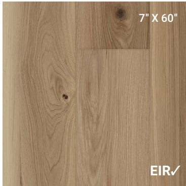
Tailored Hickory Au Naturele PP021