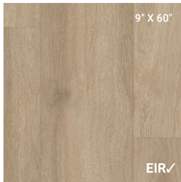
Bespoke Oak Celestial PP031