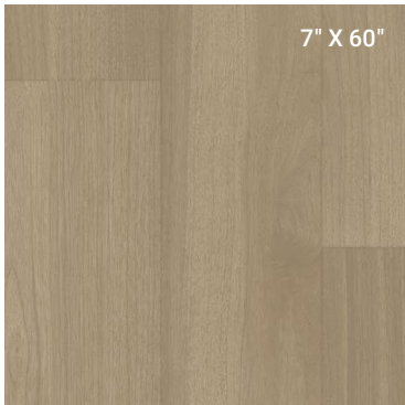
Moderne Walnut Sand PP011