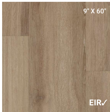
Bespoke Oak Autumn PP032