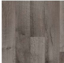
21081 | Berkshires Oak Mist 36" x 36" 14.4" Drop, DNR