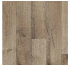
21082 | Berkshires Oak Buff 36" x 36" 14.4" Drop, DNR