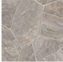
21001 | Pompano Fog 36" x 36" 18" Drop, DNR