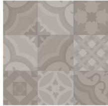
21021 | Cement Tile Whisper 36" x 72" DNR