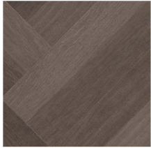
21061 | Herringbone Wolf 36" x 72" DNR