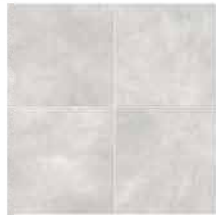
21111 | Hutchison Powder 36" x 18" 18" Drop, DNR