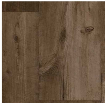
21072 | Remix Bronze 48" x 72" DNR