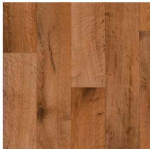
21083 | Berkshires Oak Gunstock 36" x 36" 14.4" Drop, DNR