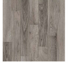
21051 | Clearwater Oak Glacier 36" x 36" 18" Drop, DNR