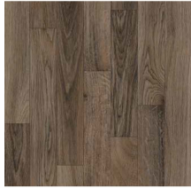
21052 | Clearwater Oak Mink 36" x 36" 18" Drop, DNR