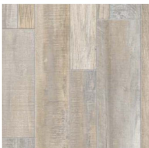
21121 | Barn Jazz Prairie 36" x 72" 18" Drop, DNR