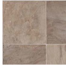
21032 | Canyon Slate Zinc 36" x 48" 12" Drop, DNR