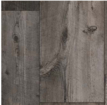
21071 | Remix Smoke 48" x 72" DNR