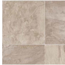
21031 | Canyon Slate Cloud 36" x 48" 12" Drop, DNR