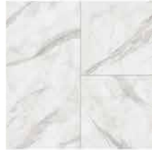
21041 | Carrara Alabaster 36" x 36" 18" Drop, DNR