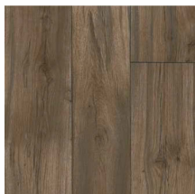
21161 | Longwood Cocoa 36" x 36" 18" Drop, DNR