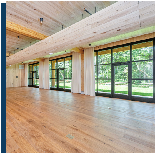
Veranda, Charleston, Carriage House