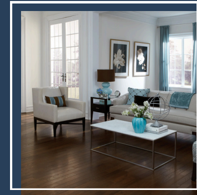
CLASSIC (SOLID & ENGINEERED)