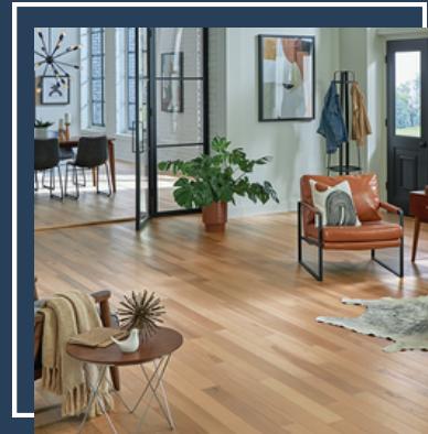
CHARACTER (SOLID & ENGINEERED)