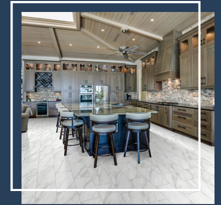
PARKWAY PRO GLUEDOWN