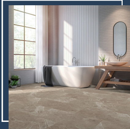
PARKWAY PRO CLICK