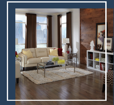
COLOR PLANK (SOLID & ENGINEERED)