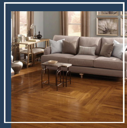
COLOR STRIP SOLID