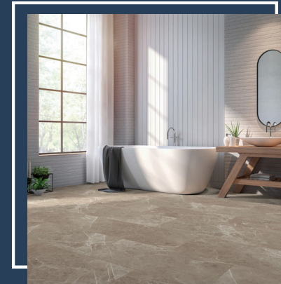
PARKWAY PRO CLICK