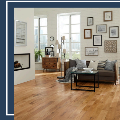
CLASSIC CHARACTER (SOLID & ENGINEERED)