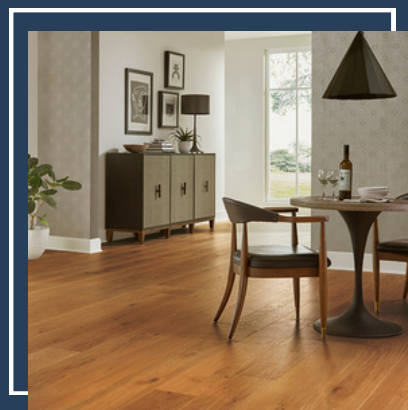
EURO WIDE PLANK